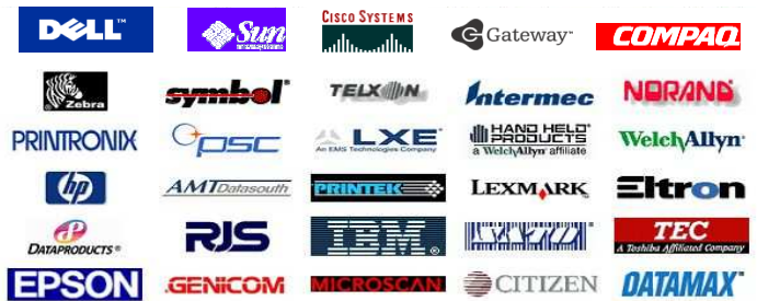
All trademarks are the properties of their respective owners.

Systems, Workstations, Servers, Printers, RF Equipment, Routers, Hubs, PCs – they all have to be maintained. There are often hundreds, even thousands of multi-vendor devices, spread across varied geographies. Wouldn't it be nice to have one integrated service contract, with one invoice, and one organization to call regarding all billing questions and pricing issues?